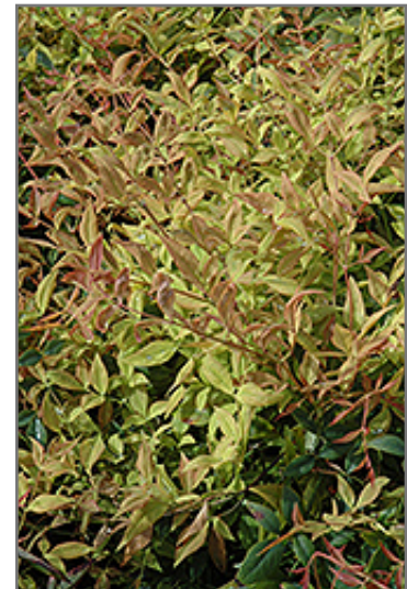
Gulf Stream Dwarf Nandina foliage