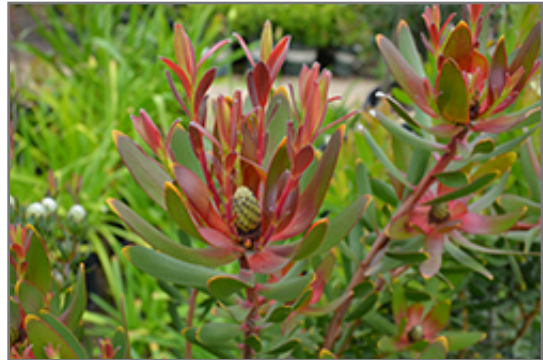
Safari Sunset Conebush flowers