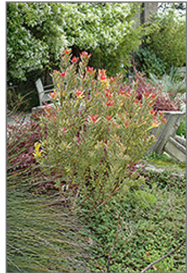
Safari Sunset Conebush

Safari Sunset Conebush makes a fine choice for the outdoor landscape, but it is also well-suited for use in outdoor pots and containers. Its large size and upright habit of growth lend it for use as a solitary accent, or in a composition surrounded by smaller plants around the base and those that spill over the edges. It is even sizeable enough that it can be grown alone in a suitable container. Note that when grown in a container, it may not perform exactly as indicated on the tag - this is to be expected. Also note that when growing plants in outdoor containers and baskets, they may require more frequent waterings than they would in the yard or garden.